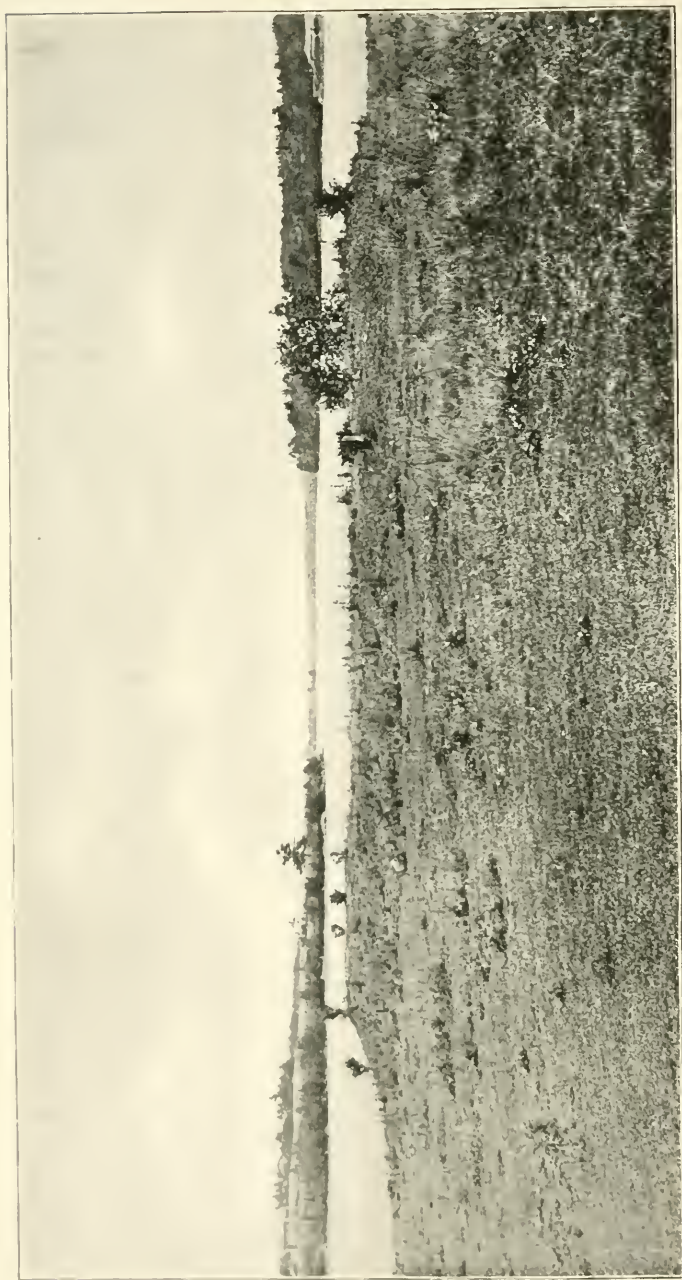
THOMPSON'S POINT, DOVER, N. H., LOOKING DOWN THE PISCATAQUA RIVER.